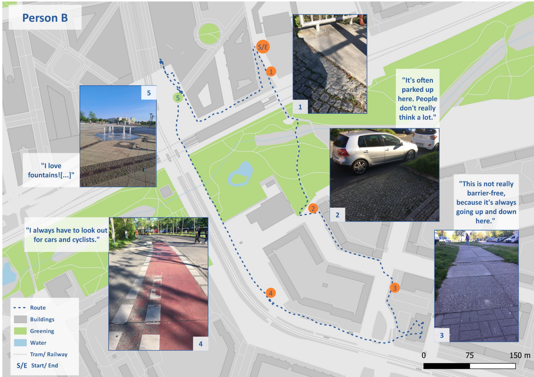
Figure 3: Route of Person B; Source: Own Data/ DLR