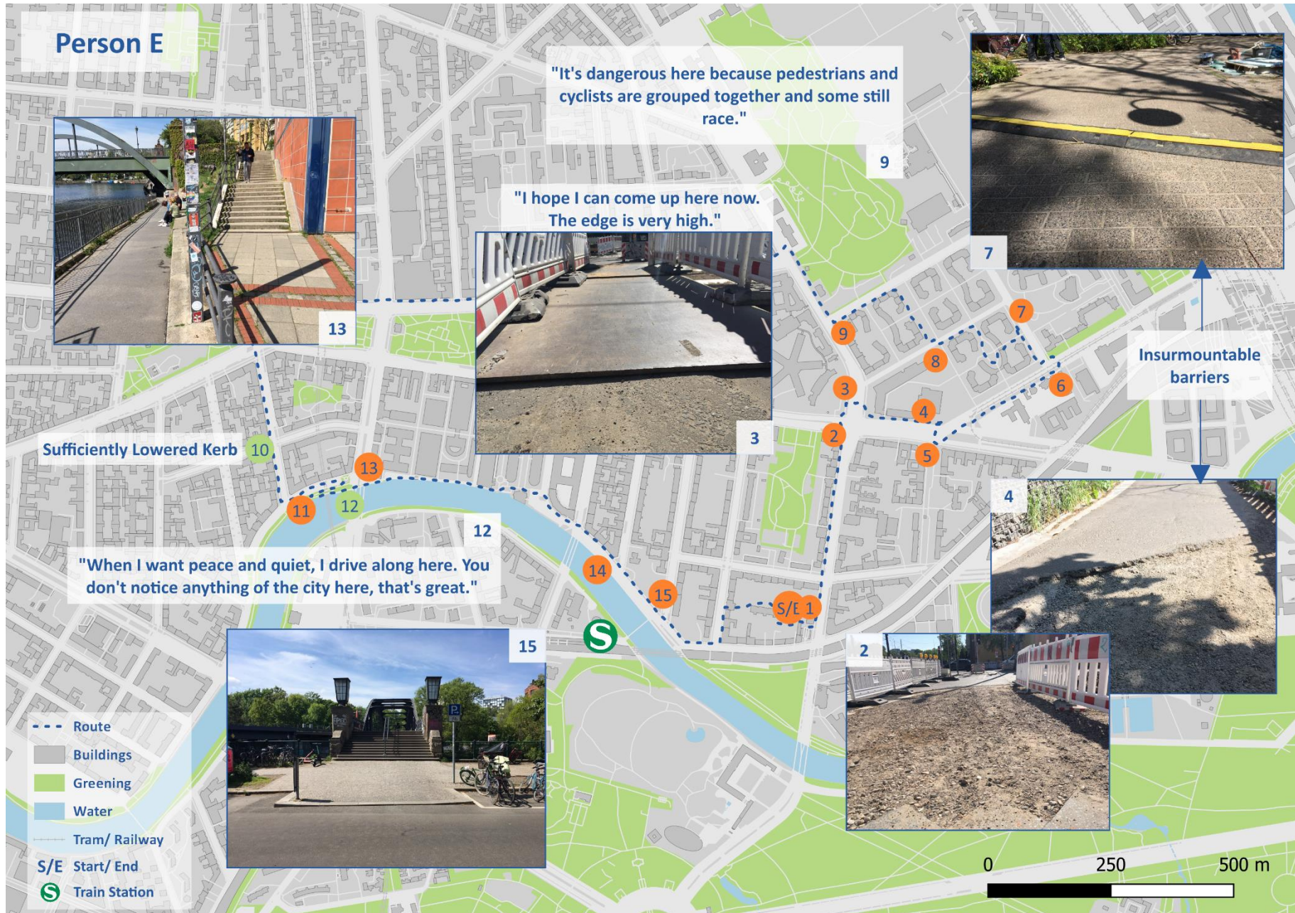
Figure 6: Route of Person E; Source: Own Data/ DLR