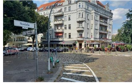
Figure 10: Recently Redesigned Intersection with Pedestrian Crossing Markings; Source: Berlin Senate

Marking alone does not always prevent parking at a pedestrian crossing, as shown in the interview with person E. In this respect, the establishment of safe pedestrian crossings should go beyond merely marking pedestrian paths. This should include the erection of bollards, which would prevent cars from parking illegally.