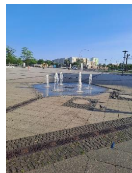
Figure 8: Blue Spaces as a Positive Influencing Factor to the Well-being of Person B

As further positive aspects, person E mentioned curbs that have already been lowered owing to road reconstruction or wide pavements. For person B, urban blue spaces had a positive influence on well-being because he/she "loves fountains" (person B).