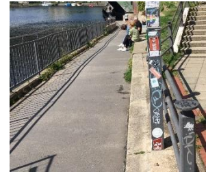
Figure 7: Cycle- and Footpath at Spree River

As described above, person B also had to use the cycle path in places to cross some intersections. Wheelchair users are often exposed to higher danger because they have to use the roadway due to the lack of lowered curbs (Henje et al. 2021, S. 4). The perceived risk of accidents also increases when construction works merge cycle- and footpaths, or when wheelchair users are forced to use cycle paths, has not yet been considered in research.