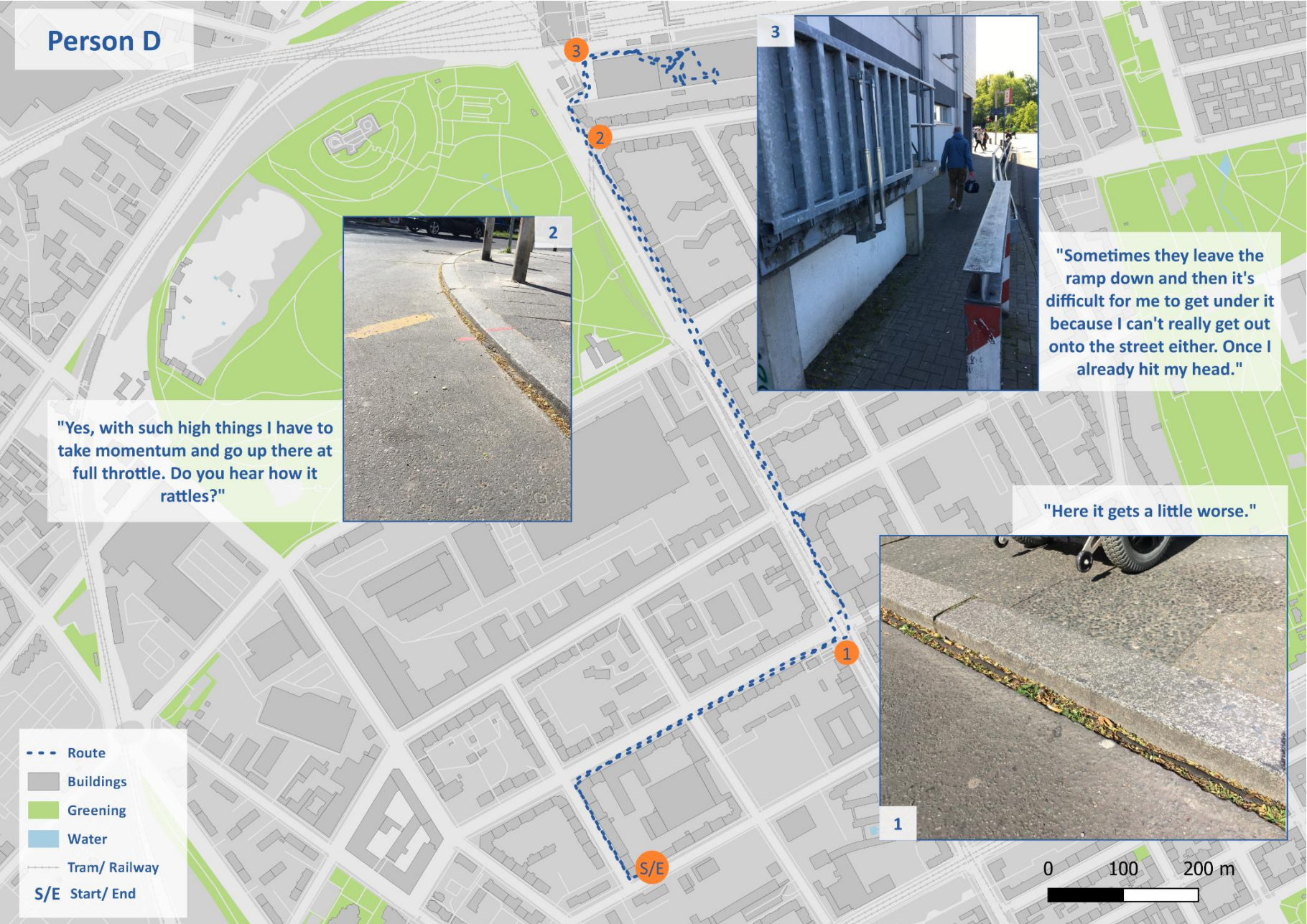
Figure 5: Route of Person D