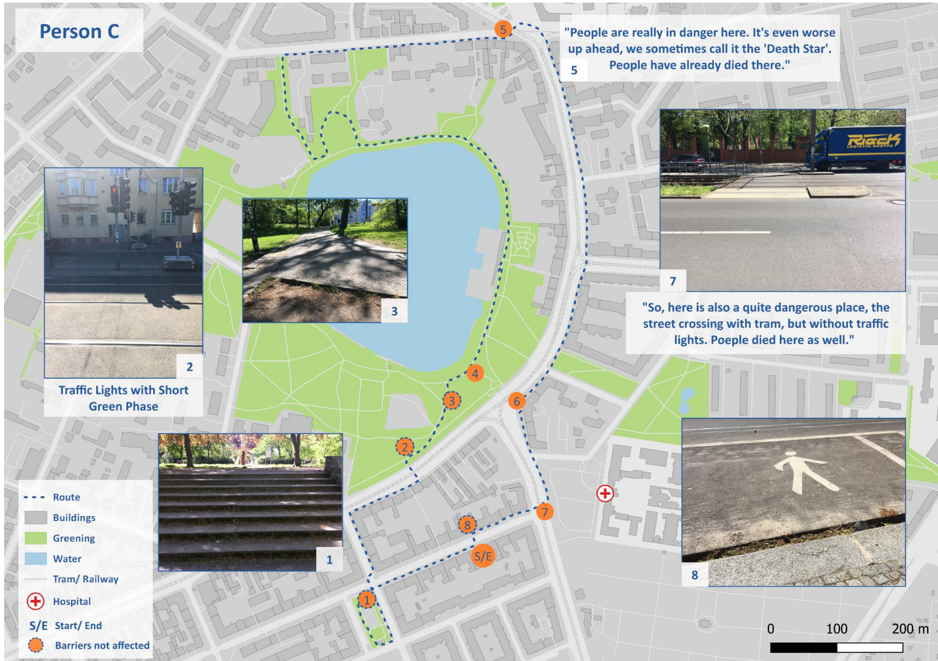
Figure 4: Route of Person C; Source: Own Data/ DLR