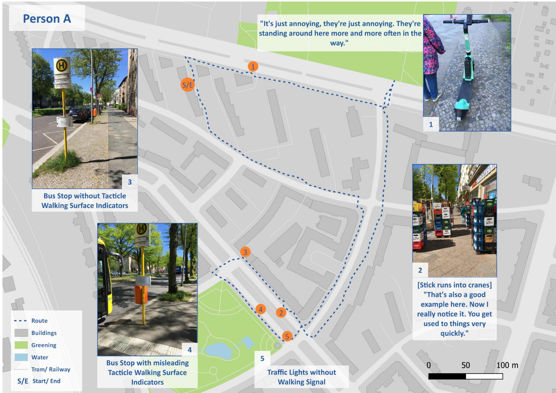
Figure 1: Route of Person A; Source: Own Data/ DLR