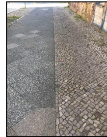
Figure 2: Different Floor Coverings of the Walkway; Source: Own Picture/ DLR

In general, it became clear from the interviews that the condition of the ground plays an extremely important role in the person's orientation. The person reports that he or she can no longer use the white cane if the pavement is covered with too many leaves or snow and states "For me, it would therefore be important that the pavements are cleared as much as possible". As positive aspects of his/her environment, the person mentioned the installed twsi at a bus stop as well as the acoustic orientation sounds of the traffic lights.