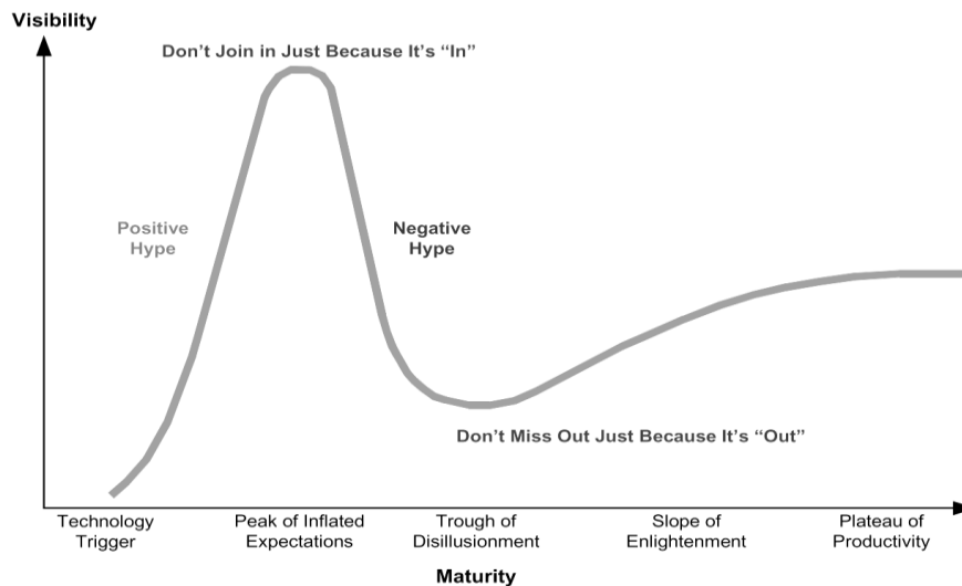
Figure 2: The Hype Curve

In order to examine the process of transformation, specifically the digital transformation, it is necessary to lay a theoretic foundation using Gartner's Hype Cycle model, which is basically an adaption to the widespread S-Curve and adoption curve model with the added dimension of technology. The Hype Cycle as shown in Figure 2 is also a measurement of risk, which decreases with augmented knowledge about technology at the end of the cycle (cf. Linden/Fenn 2003: 6ff.).