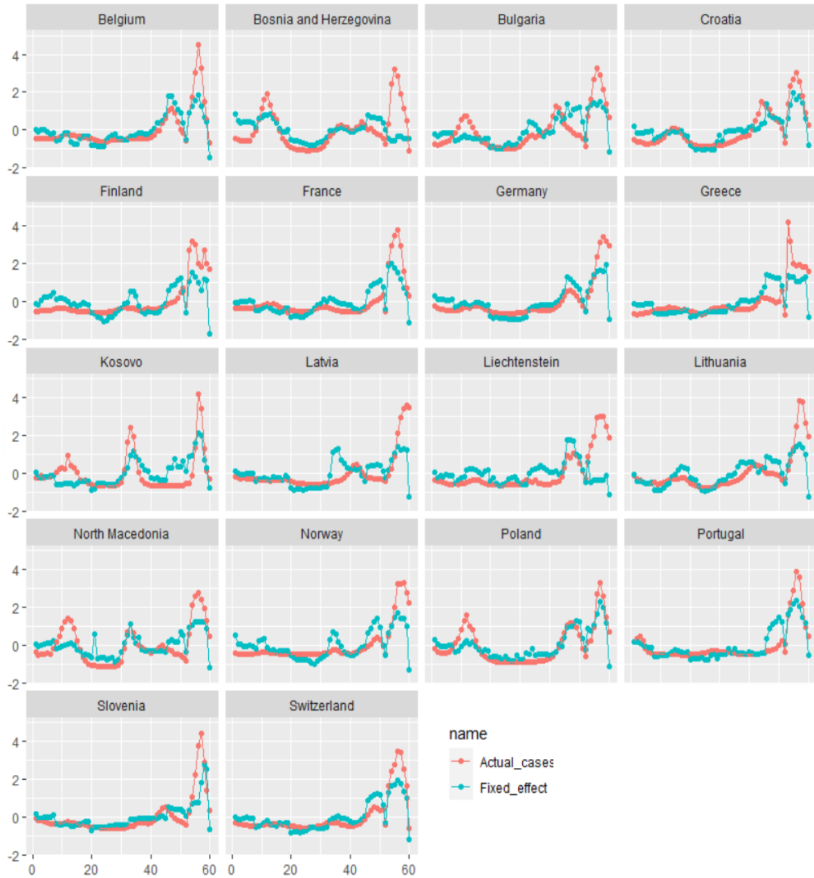
Figure 1: Actual versus fitted values (Infections) based on fixed effects estimation