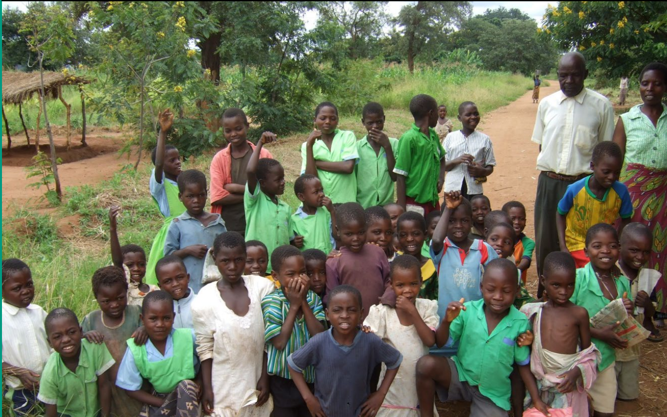
Malawi, 2007