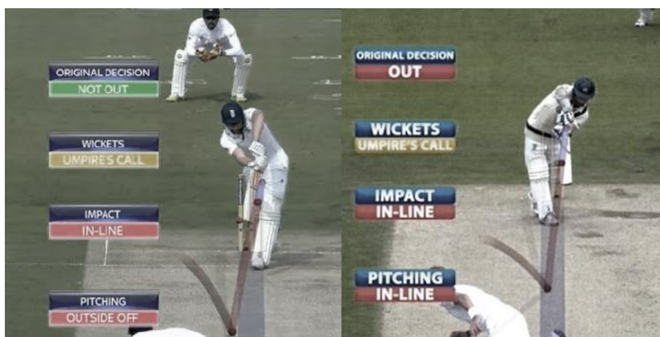
Figure 1. Illustration of Umpire’s Call affecting review outcomes

HYPOTHESIS 2.2 The home team receives relatively more umpire’s call outcomes of reviews than the away team during the pandemic than pre-pandemic.