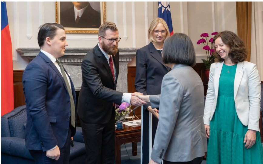
President Tsai meets delegation from Swedish-Taiwanese Parliamentarian Association.