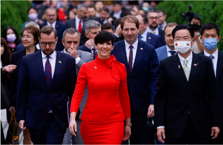
Photo and description: Ann Wang/Reuters/Ritzau Scanpix The Speaker of the Chamber of the Deputies of Czech Republic Marketka Pekarova Adamova leaves after visiting the parliament in Taipei on March 28, 2023.

expansionists (Czechia and Lithuania) and two isolationists (Bulgaria and Greece), the report also examines two European great powers (France and Germany) that traditionally play a leading role in shaping the policy positions of smaller states. The aim here is not to explain the observed variation – i.e. the underlying reasons for taking an expansionist or isolationist stance – but merely to describe the different positions.