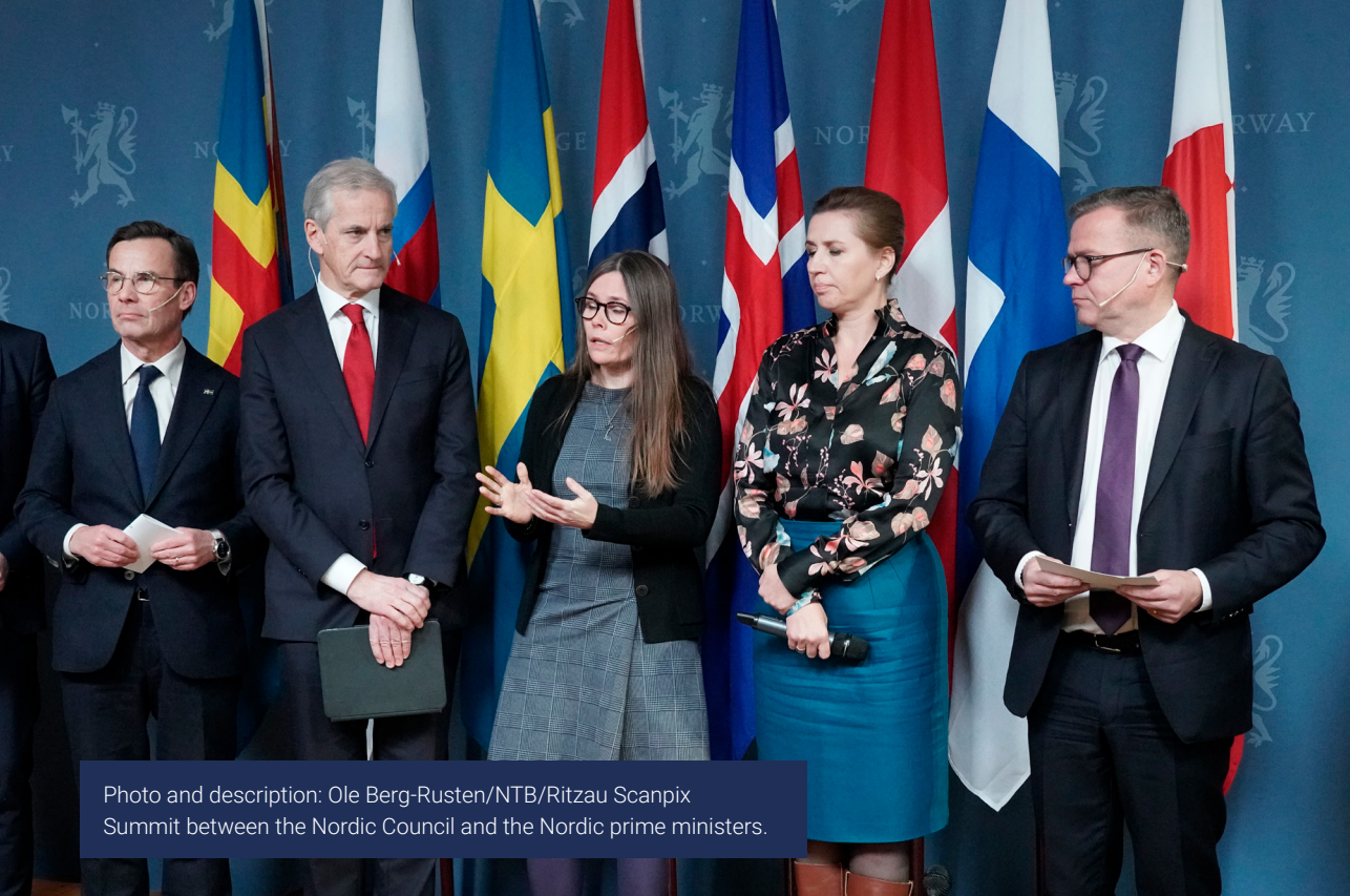
Photo and description: Ole Berg-Rusten/NTB/Ritzau Scanpix Summit between the Nordic Council and the Nordic prime ministers.