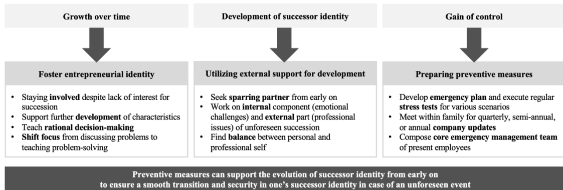
Figure 3: Action Implications for Unforeseen Events in Family Firms