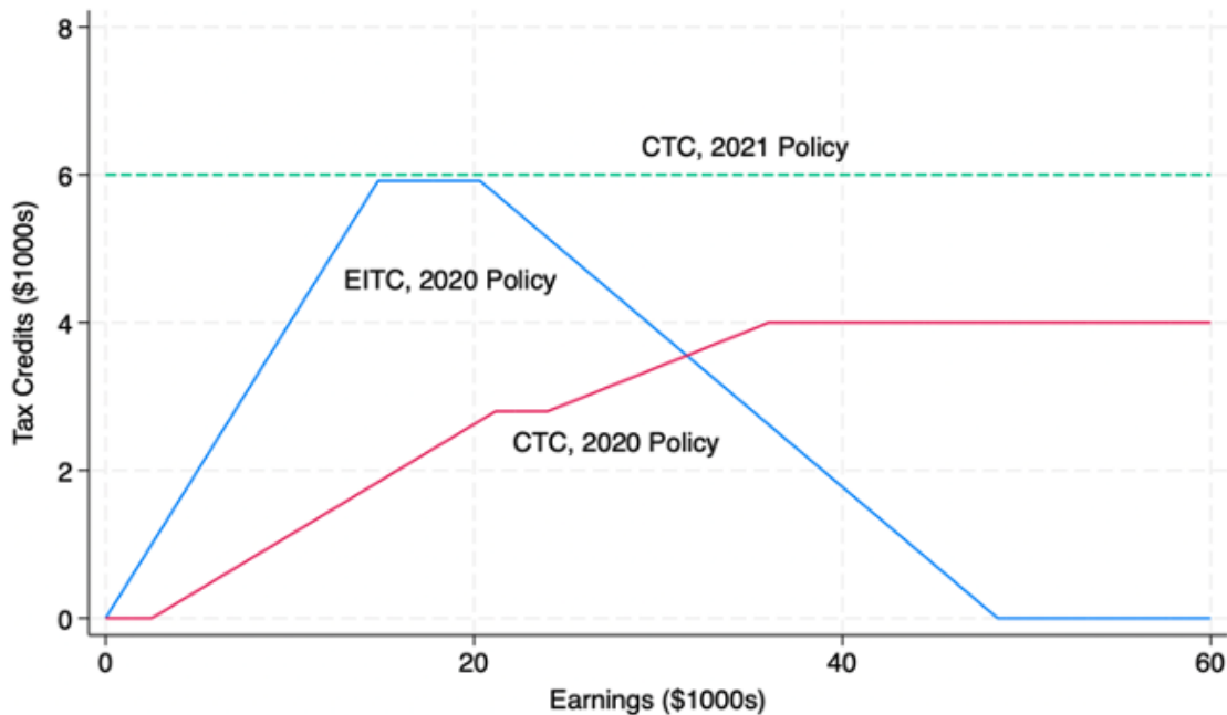
Figure 1. CTC and EITC for Married Parents with Two Children (Ages 6–16)

some portion of the phase-out range for EITC benefits before reaching the maximum benefits for two children of $4,000. For married parents, these benefits remain at the $4,000 level before starting to be phased out when joint earnings reach $400,000. The upward-sloping portion of the 2020 CTC policy would induce substitution effects that would tend to increase hours worked, while the flat portions are associated only with an income effect. An income effect is predicted to decrease hours worked but is generally expected to have a smaller distortionary effect than a policy with a substitution effect. The pro-employment incentive effects of the 2020 CTC are eliminated in the 2021 CTC, which would be expected to reduce employment (though the pro-employment impacts of the EITC remain).