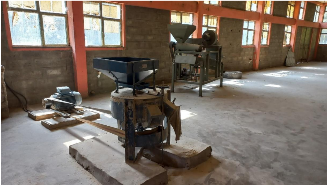
Figure 2: The grinder machine used at Almi foods production facility Hawassa Industrial Park