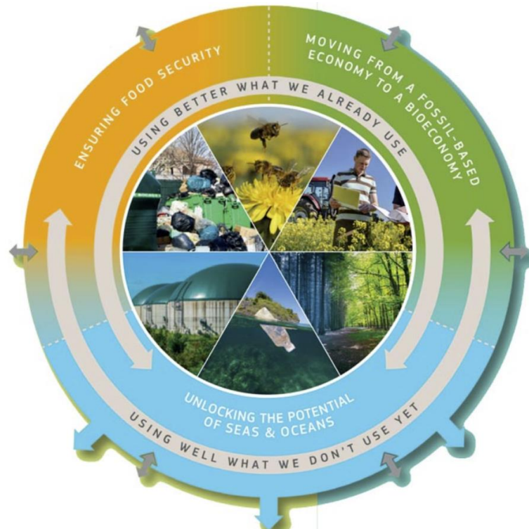
Figure 2. Bioeconomy in Europe according to EU Bioeconomy strategy

In the specialized literature, seven industrial branches are identified whose technological flow is based on the use of renewable natural resources for the production of bioproducts. These sectors contribute to the development of the bioeconomy, as follows: agriculture and forestry,