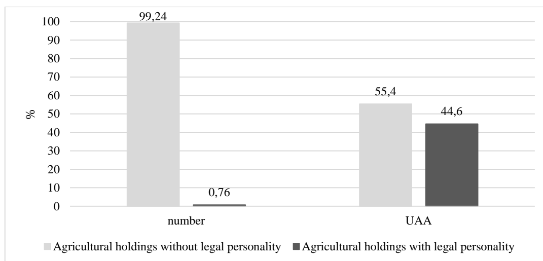
Figure 1. Distribution of agricultural holdings by legal status

(Source: own calculations based on NIS, FSS 2016)