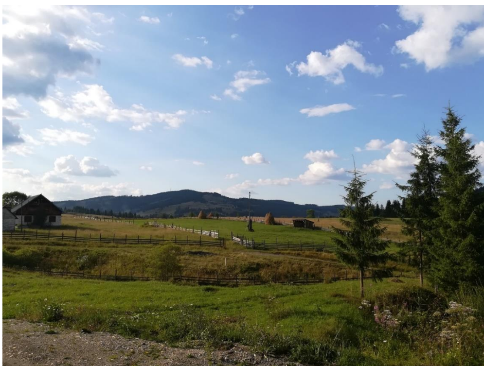
Figure 2. Agricultural landscape, Dornelor Basin, Suceava county

Respondents' characteristics highlight an important agricultural experience of farmers from the case study area, as well as a significant share of higher education and high school levels, around 20% having a background in agricultural area. As regards the agricultural landscape, due to the geographical particularities of the case study area (hilly and mountain region), this is clearly dominated by the presence of permanent grassland area, with various functions: as areas with pure meadows (only cut), pure pastures (only grazed), strip grazing pasture and mixed use.