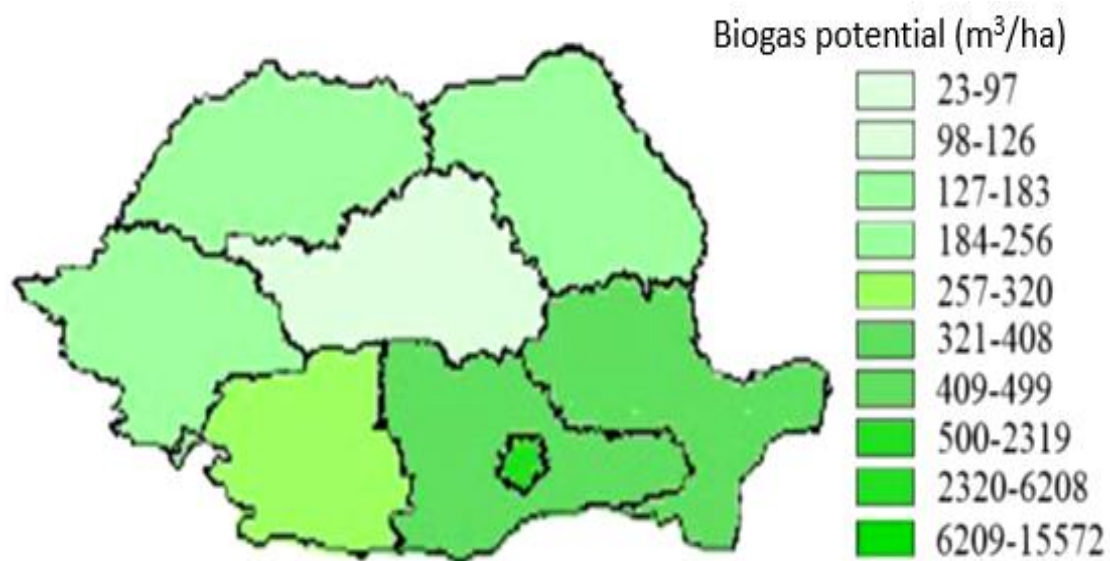
Figure 2. Potential biogas production in Romania (Al Seadi T. et al., 2008)

The average potential value of biogas production in cubic meters per ton of organic matter is shown in figure 2 (based on data from the literature and those already available from WP 6 of the Big-East project).