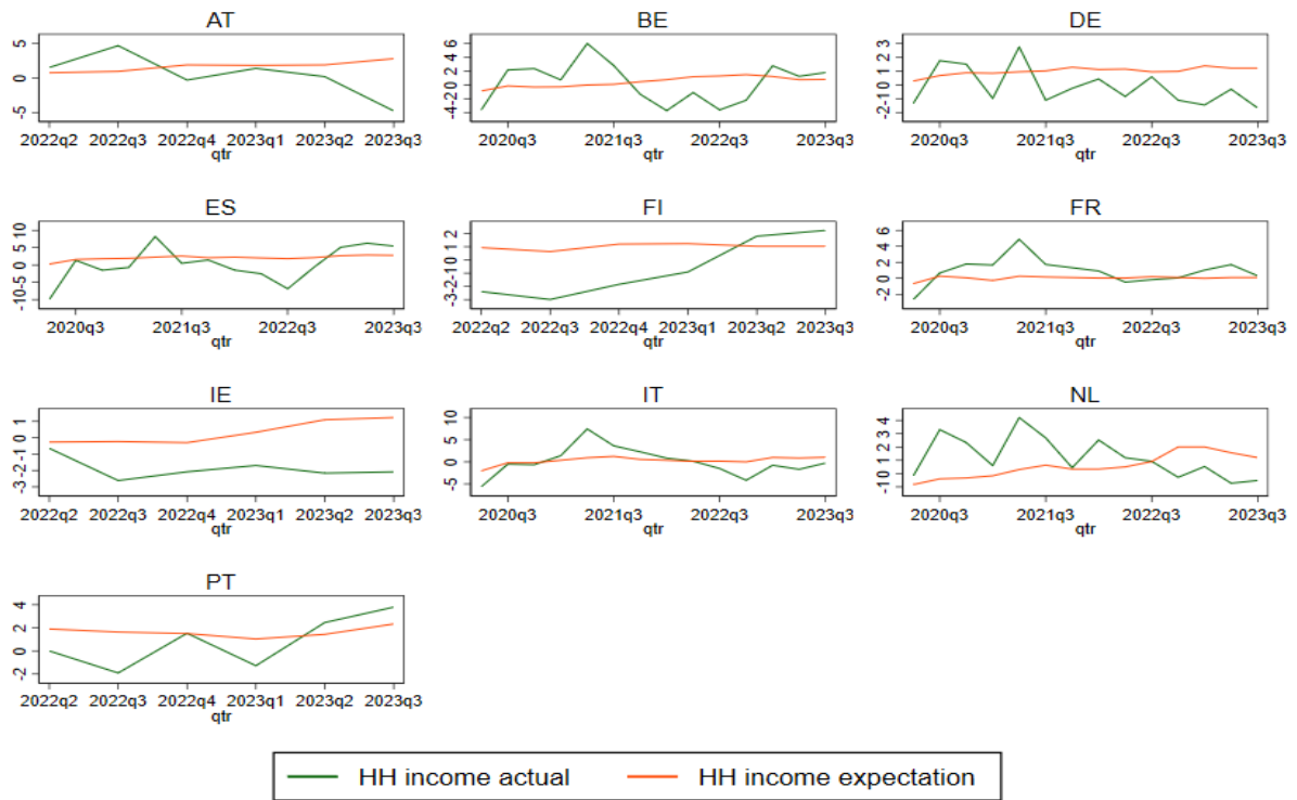
Figure 2: Actual household income and expected household income: Cross-country comparison

Notes: The figure illustrate trends for actual household income growth and expected household income growth for 11 sample European countries for the period 2020-2022.