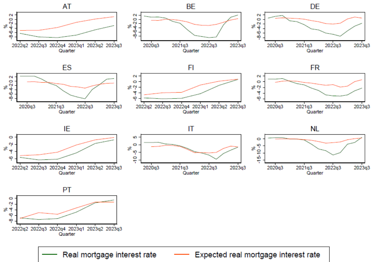
Figure 3: Real interest rate and expected real interest rate: Cross country comparison

Notes: The figure illustrate trends for real interest rate and expected real interest rate for 11 sample European countries for the period 2020-2022.