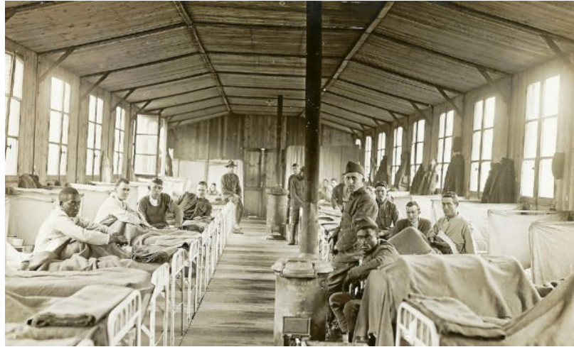
Observation room in the American hospital at Pontanézen (US National Archives and Records Administration)

Mass troop movements ensured that the virus spread rapidly from these camps to many other military bases in North America, to the civilian population and then across the Atlantic to Britain and France, primarily aboard troopships. From this heartland of the world war and world trade, it was then spread to several parts of the northern hemisphere by similar means between May and July 1918. The SS Kroonland arrived in Brest on 12 September 1918, full of US troops for the war in Europe. Two of her crew died of the flu en route and she brought 117 cases of influenza and 6 of pneumonia. 65 The huge army camp in nearby Pontanézen facilitated the spread of the virus. A peak in deaths in the Brest region followed on 17-20 September.