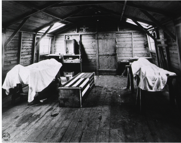
Morgue in U. S. Army Hospital, Gievre, France

Cyanosis”—the term refers to a person turning blue from lack of oxygen—“extending from their ears and spreading all over the face....It is only a matter of a few hours then until death comes...It is horrible....We have been averaging about 100 deaths per day...For several days there were no coffins and the bodies piled up something fierce...” 68