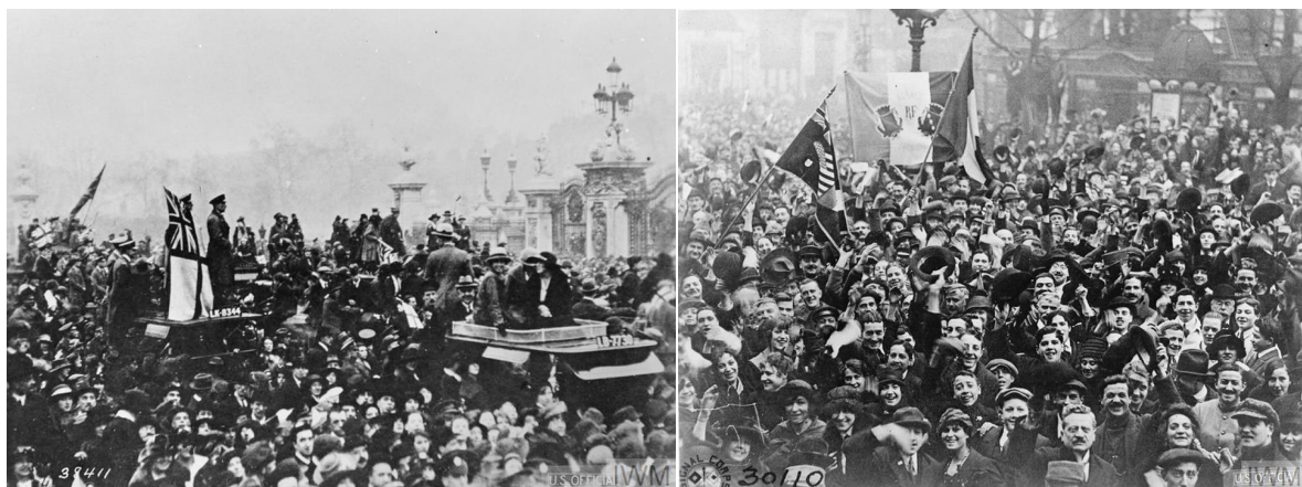
Armistice Day Crowds in London and Paris, 11 November 1918

But the claim the celebrations increased the death toll there had been no social distancing before them in any case. People had been at work as usual, etc. Indeed, in the wake of the celebrations in Dublin the Irish Times , then a Unionist paper, reported that "the electric feeling in the air for past couple of days and nights in Dublin has apparently 'electrocuted' the influenza germs in millions and routed them as completely as the Allies have routed the Germans". 102