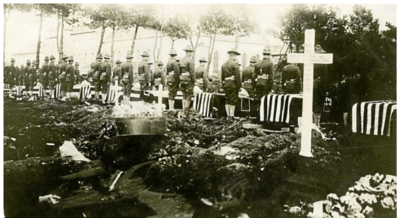
Burial ceremony for AEF troops at Kerfautras graveyard

The most likely source of the second, much deadlier, variant is army training camps in the United States and the movement of the American Expeditionary Force to Europe in the autumn of 1918. The Boston area and, more specifically, the military encampment at Fort Devens west of Lowell, were the first places in the U.S. to be hit by the second wave in September 1918. The virus made its way south and west from Massachusetts “following wartime transportation routes with its human hosts”. The first recorded death in New Jersey in the same month happened at Fort Dix in the south of the state on 18 September. Soon there were reports from other army camps Kansas (20 September), California (27 September), and Iowa. Two remote camps in Georgia were not hit until 11 October. Within a month the virus was nationwide: the New York Times reported on 16 October that influenza had reached epidemic proportions in “practically every State in the country” 63 . The overcrowded conditions in which troops lived and travelled greatly eased the transmission of the virus. The pattern of diffusion in Europe (from Brest) and the Americas (from Boston) was not dissimilar, with infected soldiers and sailors once again being the principal carriers. 64