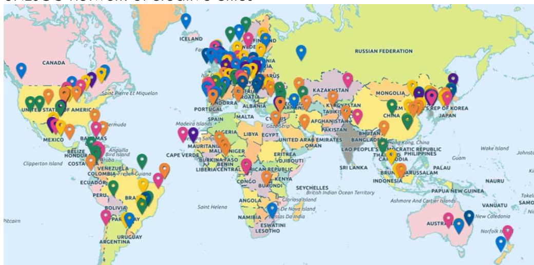
Figure 1 UNESCO network of creative cities