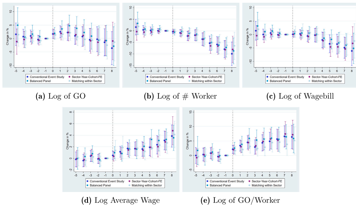
Fig. A.2. Robustness: Alternative specifications.

Notes: Each subfigure reports results for one outcome from four different empirical specifications: a conventional event study as opposed to the approach by Sun and Abraham (2021), a specification with year-cohort-sector fixed effect, a balanced panel specification and an alternative matching, i.e., matching within economic sectors. The number of observations varies by specification and is, in the above order, 54055, 51978, 27098, 53365. The dots in the figures mark the point estimates, and the vertical lines show the 95th confidence intervals, with standard errors clustered at the level of the matched pairs.