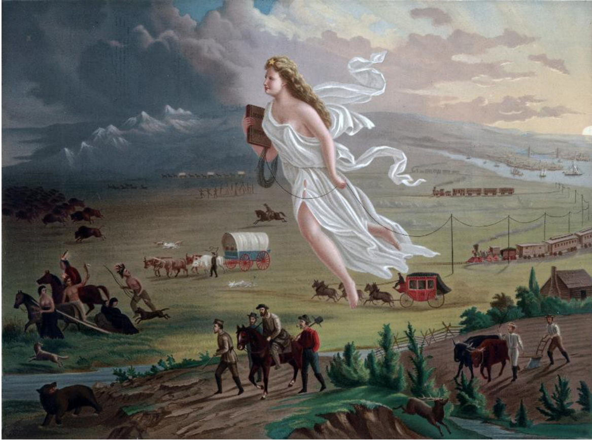
Fig. 1. — American Progress (John Gast, 1872). Painting in the public domain.