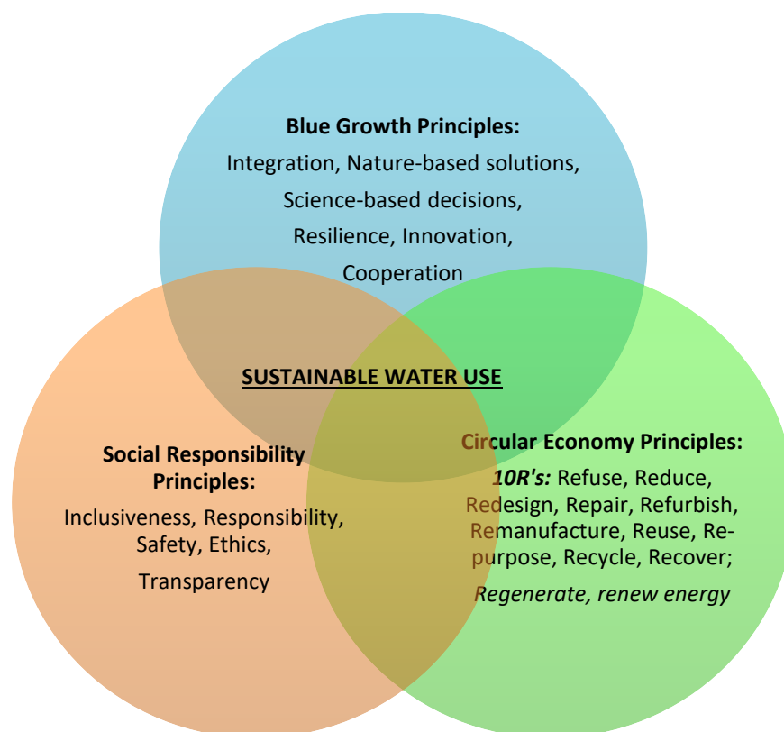
Fig. 3. Interrelation of circular economy, blue growth and social responsibility principles in ensuring sustainable water use