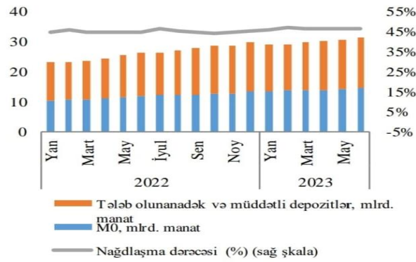
Figure 2. Cash flow (M0/M2)