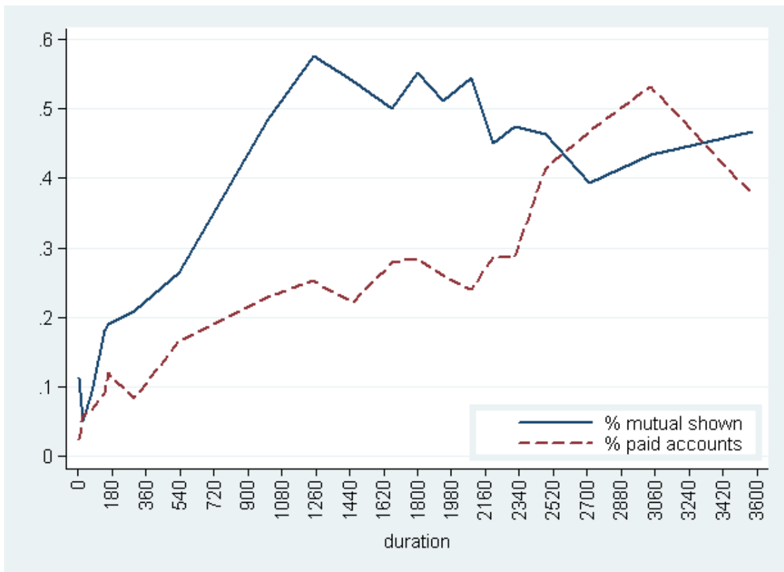
FIGURE D.1. % of bloggers showing mutual friends and % with a paid account, by duration vigintiles.