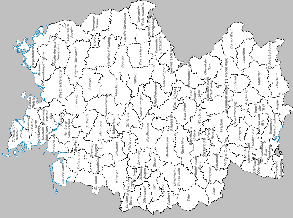
Figure 1 Raumordnungsregionen in Germany