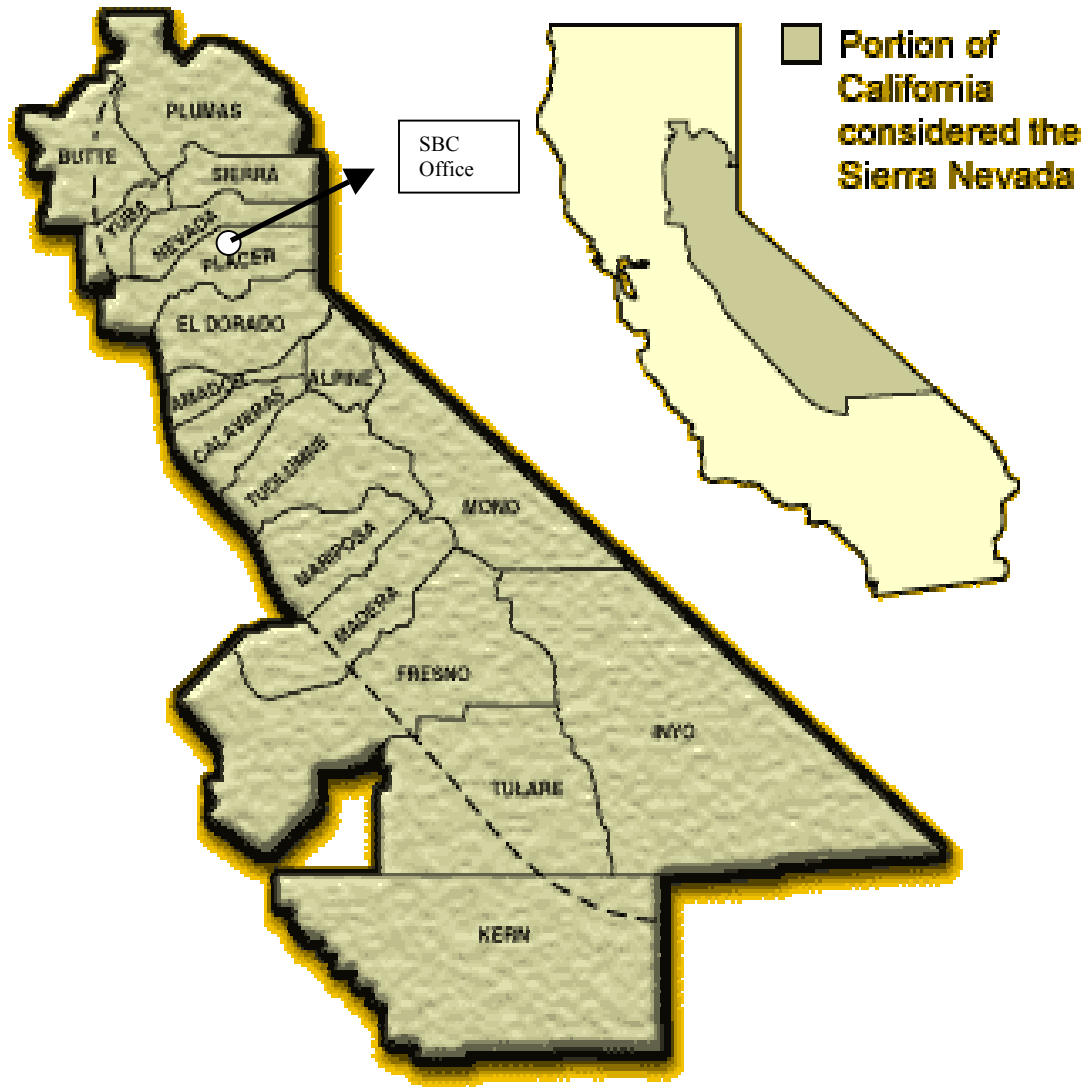
Figure 1. Map of the Sierra