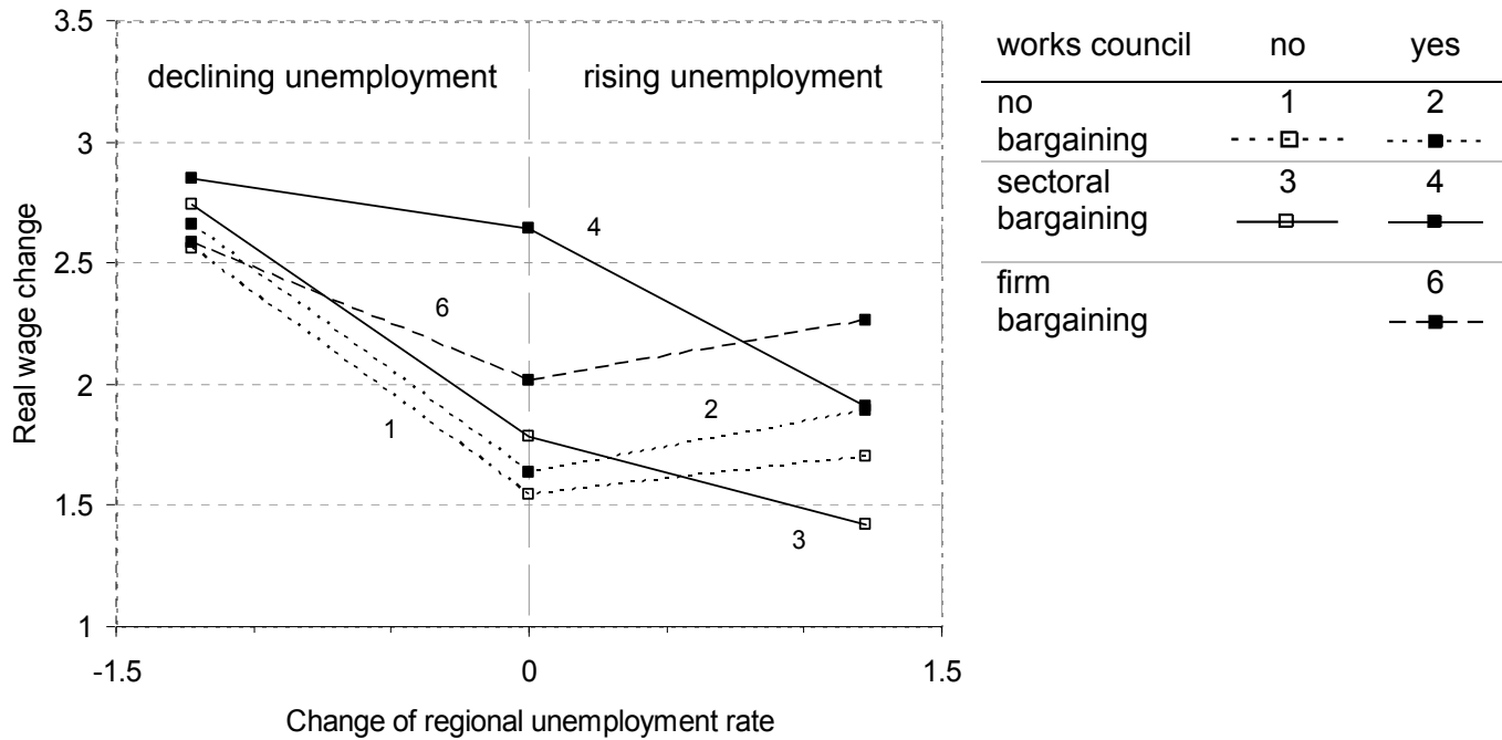
Figure 3: Real wage changes and unemployment changes in different industrial relation regimes

Note: Simulation of the reaction of wages (change between two consecutive years in log wages) to a change in the unemployment rate u_t based on Model 2 (Table 3)