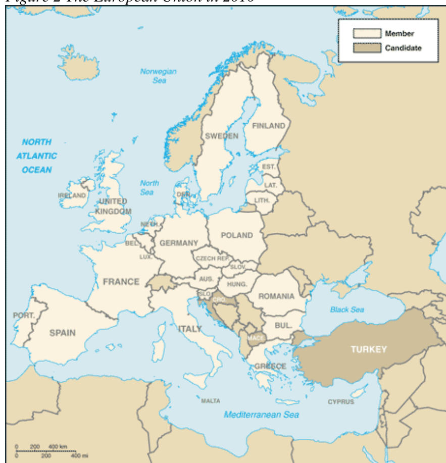
Figure 2 The European Union in 2010

areas if at some point in the history of our sample they are affected by an integration shock. An example is Germany. Border areas along the Dutch-German border are excluded as they experience no integration shock with respect to integration since the entry of The Netherlands and Germany into (the forerunner of) the EU already took place in 1951. However, border areas along the German-Polish border are included in the definition of border areas as they are affected by integration (in 2004). For the case of the Euro shock we follow the same procedure (implying that for the Euro shock border areas along the Dutch German borders are included in the border definition).