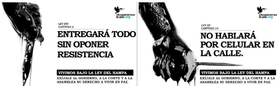
Figure 1: Recuperamos la Paz Advertisements 5