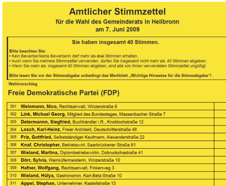
Figure 1: Ballot: Free Democratic Party, Heilbronn, local elections 2009.