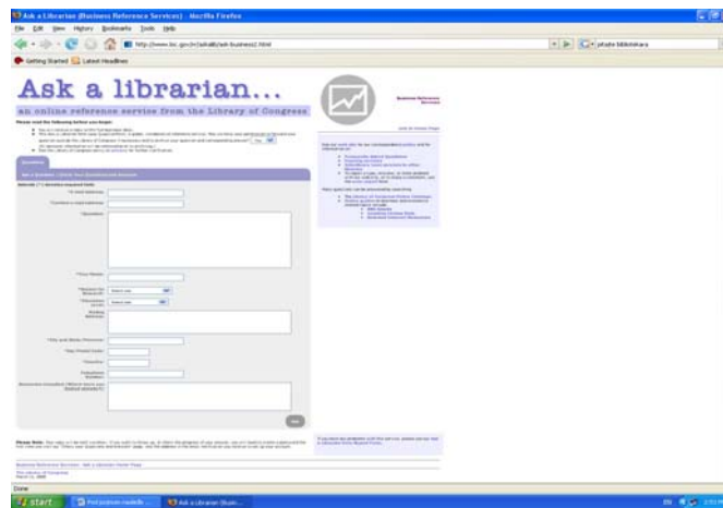
Figure 1: „Ask a librarian“ question page