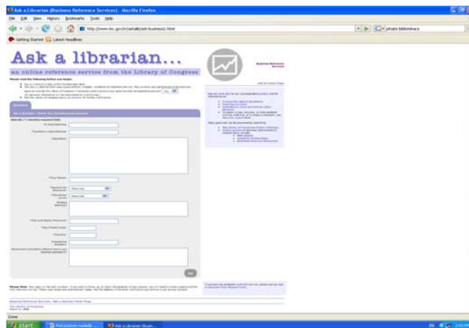
Figure 1: „Ask a librarian“ question page