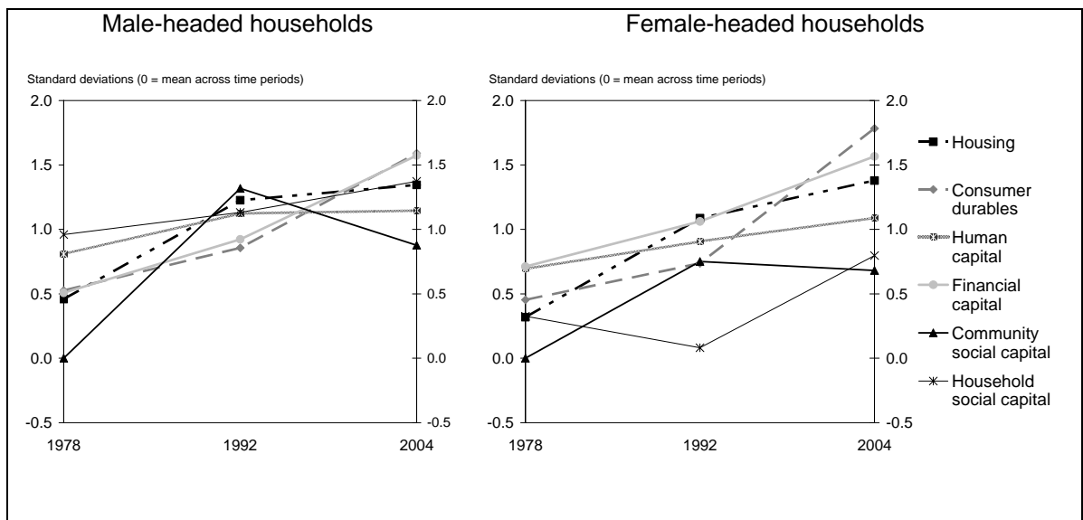
Figure 2: Asset accumulation over time in male- and female-headed households