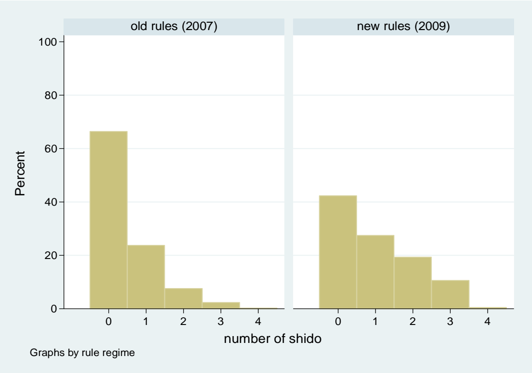
Figure 1: Distribution of the number of shido per observation, by rule regime