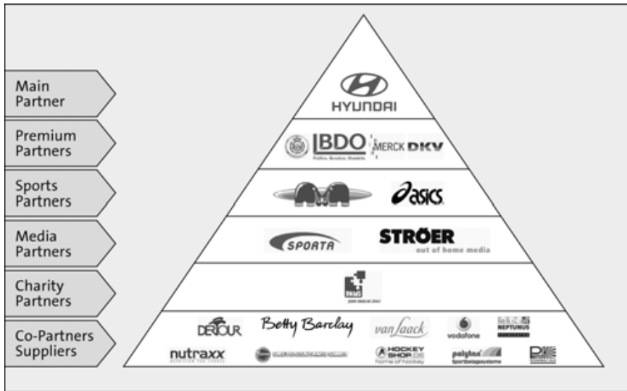
Figure 3: Pyramid of Sponsors and Partners