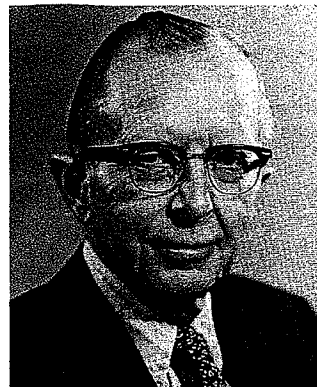
Paul W. McCracken