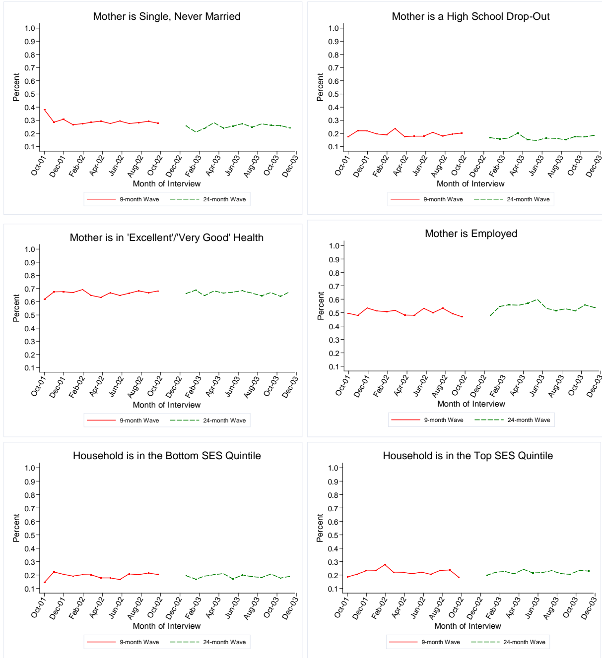
Figure 3: Family Characteristics by Month of ECLS-B Assessment