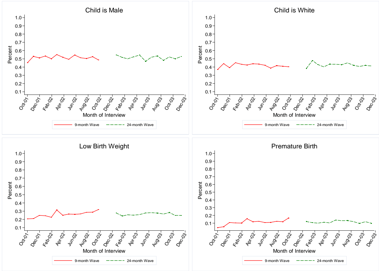
Figure 2: Child Characteristics by Month of ECLS-B Assessment