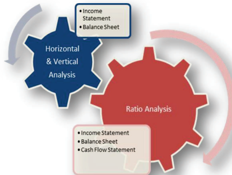
Figure 1: Paper overview

Management accounts might be regarded as performance agents helping the company to achieve its desired performance. But what is performance and what are the commonly accepted measures of performance? Financial statements are the condensed performance reports of companies. They are based on the accounting data which form the language of business and are described in line with generally accepted accounting principles (US GAAP, IFRS, HGB, etc.). They can provide the initiated reader (be it as (prospective) shareholder, competitor or employee) with valuable insights about the financial vitality and value of a company. 1 Companies are under scrutiny by banks as well as investors, and subject to performance expectations that are largely expressed in accounting ratios. Graduates in Business Administration and future management accountants need to be able to read, analyze and interpret financial statements in order to prepare and make informed management decisions, and find levers for action to improve the company's performance.