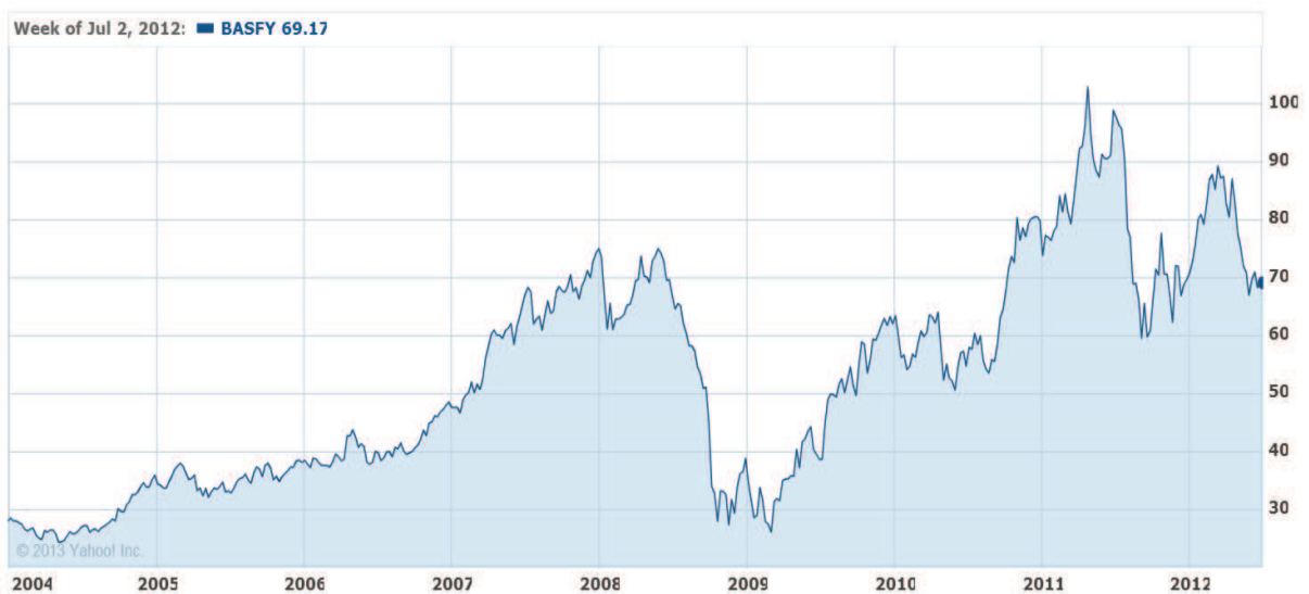
Figure 5: BASF share price history

Comparison of share price development between BASF and Dow Chemical: