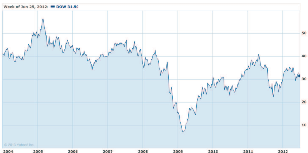
Figure 6: Dow Chemical share price history

BASF SE more than doubled its share price from 2004 to July 2012. Investors were obviously happy with the long-term performance of BASF.