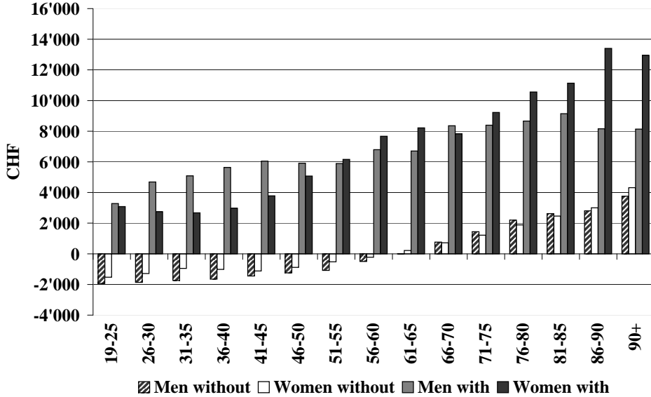
Figure 1: Cross-subsidies by age group, persons without / with hospitalization or living in nursing home during the previous year, canton of Zurich, CHF (2005)

The new criterion has several advantages. It is very easily collected; moreover, being a dummy variable it does not make computation of RA payments much more difficult. While the formula currently distinguishes 30 age-gender cells, the number of classes would only increase to 60 (for a discussion on other alternatives and their drawbacks see e.g. Lamers [1999], Van de Ven et al. [2004], Lamers and Van Vliet [2003a], Lamers and Van Vliet [2003b], Ellis and Van de Ven [2000] Beck et al. [2006], and Van de Ven and Schut [2007]). Moreover, the data is readily available in every insurer's administrative database.