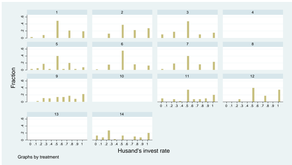
Figure 1: Histograms of male contribution rates by treatment