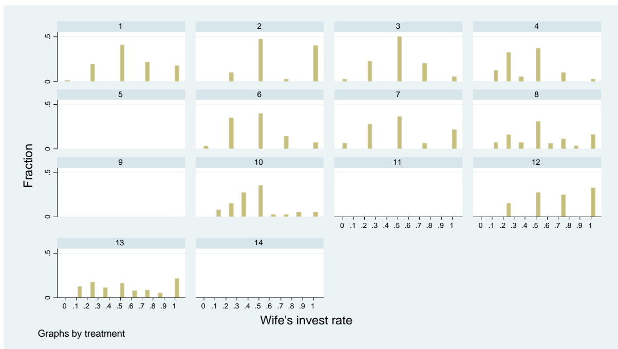
Figure 2: Histograms of female contribution rates by treatment