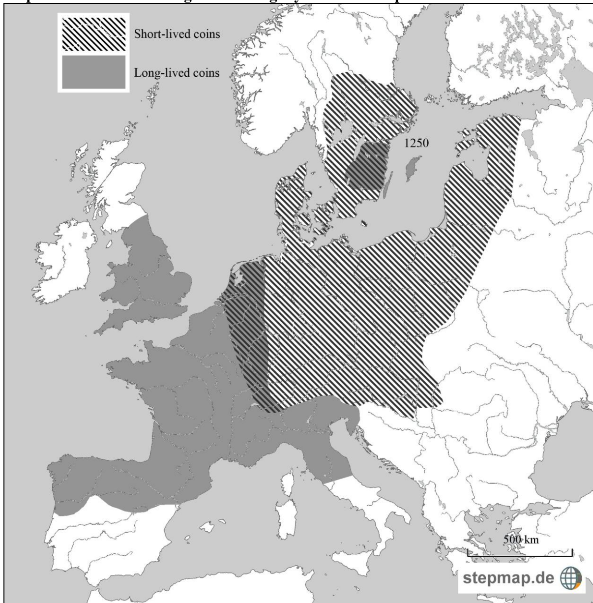
Map 1. Short-lived and long-lived coinage systems in Europe 1140–1300.

Note: Eastern Götaland, Sweden, changed from long-lived to short-lived coins ca. 1250.