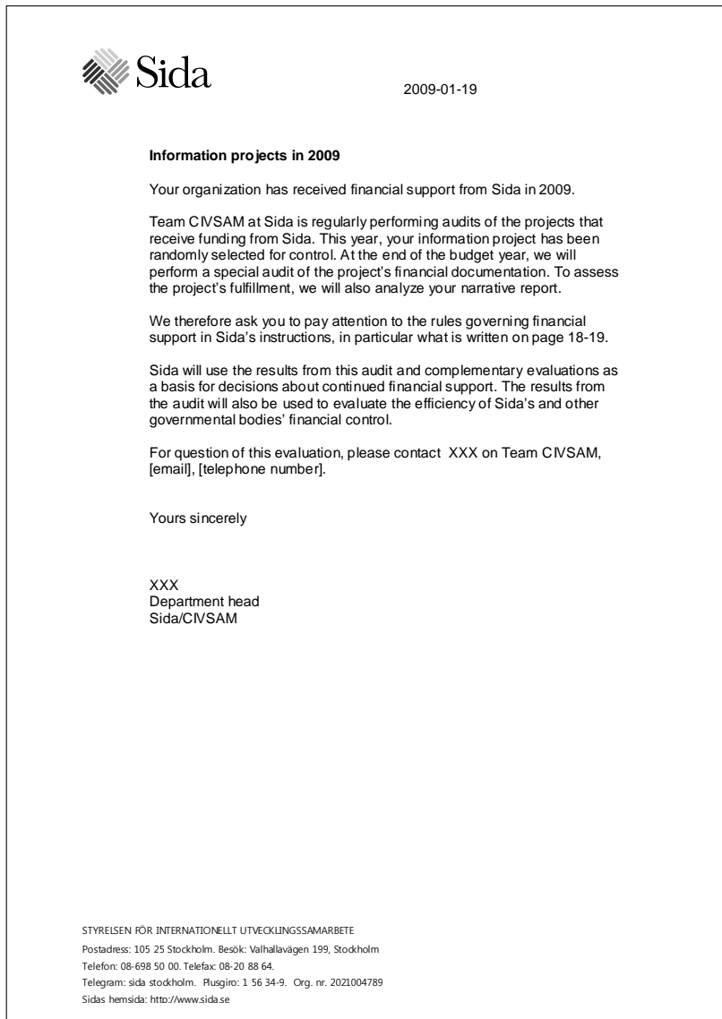
Figure 3: Letter sent to the treatment group in February 2009. Translation from Swedish to English by authors.