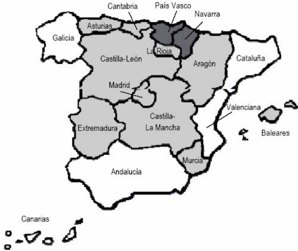
Figure 1- Asymmetric Fiscal Decentralization in Spain