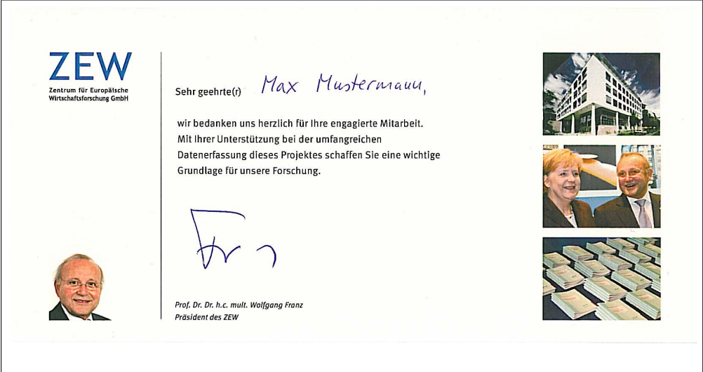
Figure 1: Thank-you Card