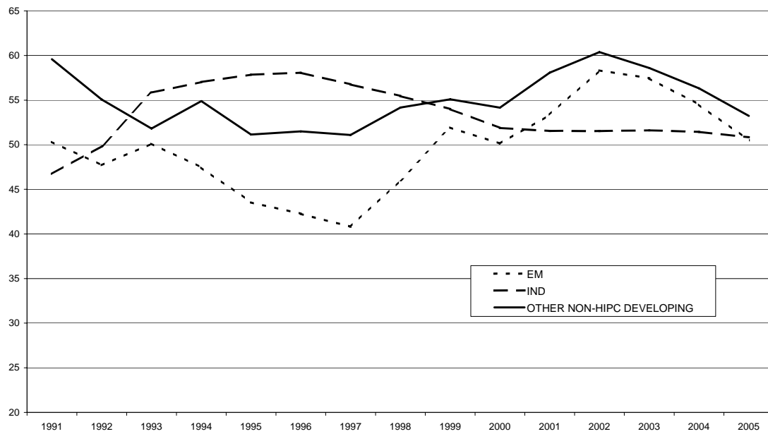
Figure 1. Simple Averages