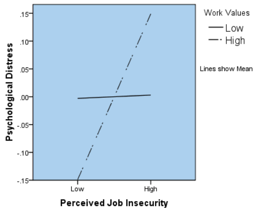
Figure 2. Interaction between Perceived Job Insecurity and Work Values Predicting Psychological Distress

perceived job insecurity and psychological distress was supported. This means that the more employees value extrinsic needs of work, the more they are likely to perceive job insecurity and become psychologically distressed. Inversely, the more work values tend to be intrinsic, the less the perception of job insecurity and its associated psychological distress.