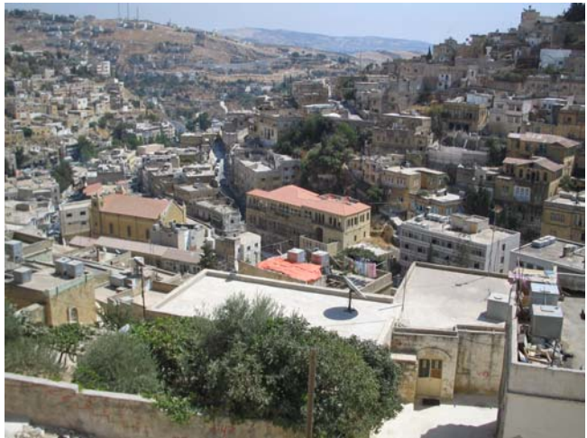
Picture 4. View of Salt city

There is an academic institution named Al-Balqa Applied University in Salt. The university was established in 1997 with 16 colleges for two years courses in different location in Jordan. Its objectives are not only to provide educational opportunity for younger generation but to cooperate with local community.