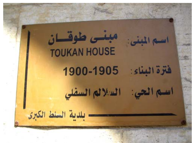
Picture 5. A Sign for the designated historical building