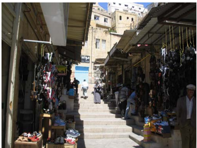
Picture 7. Paved Market Street