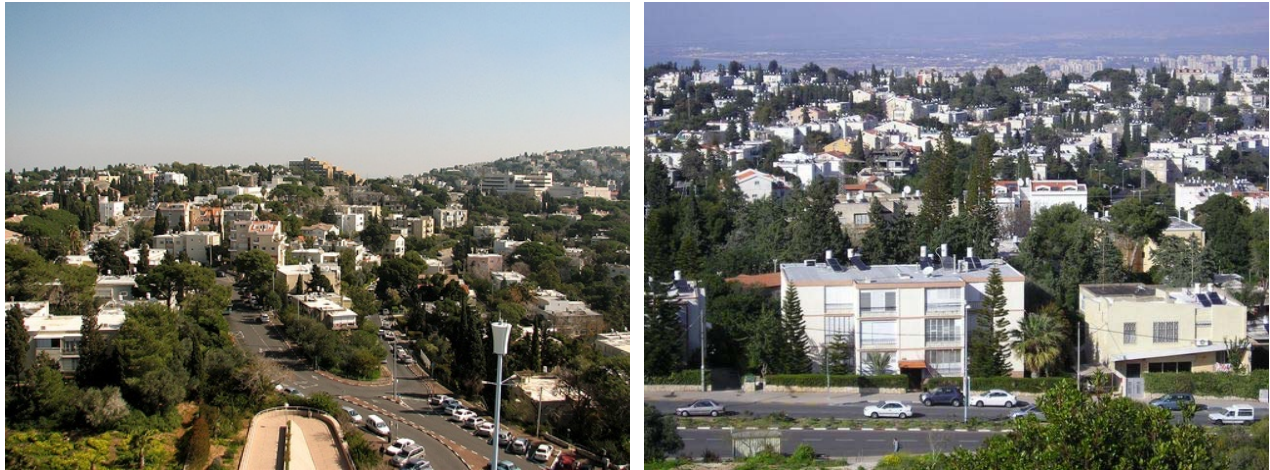
Figure 2 - Similar vegetation in Ahuza (left) and Neve-Shaanan (right)

In terms of socio-economic level, the CBS socio-economic index rating of the two neighbourhoods is similar: 7 in Neve-Shaanan and 8 in Ahuza on a 10-points national scale (CBS, 1995). In terms of shopping and leisure opportunities, although the Ahuza neighbourhood offers more shopping opportunities along its main street, both neighbourhoods are located within very short driving distance from nearby large and relatively new shopping malls, hosting a variety of shops, restaurants and coffee shops, cinemas and gyms. In terms of location and view, both neighbourhoods are located on the top of the Carmel Mountain and both neighbourhoods include properties without a view as well as properties looking at either the green Carmel mountain slopes or the Mediterranean sea of Haifa bay. The two neighbourhoods are also similar in terms of vegetation as demonstrated in Figure 2.