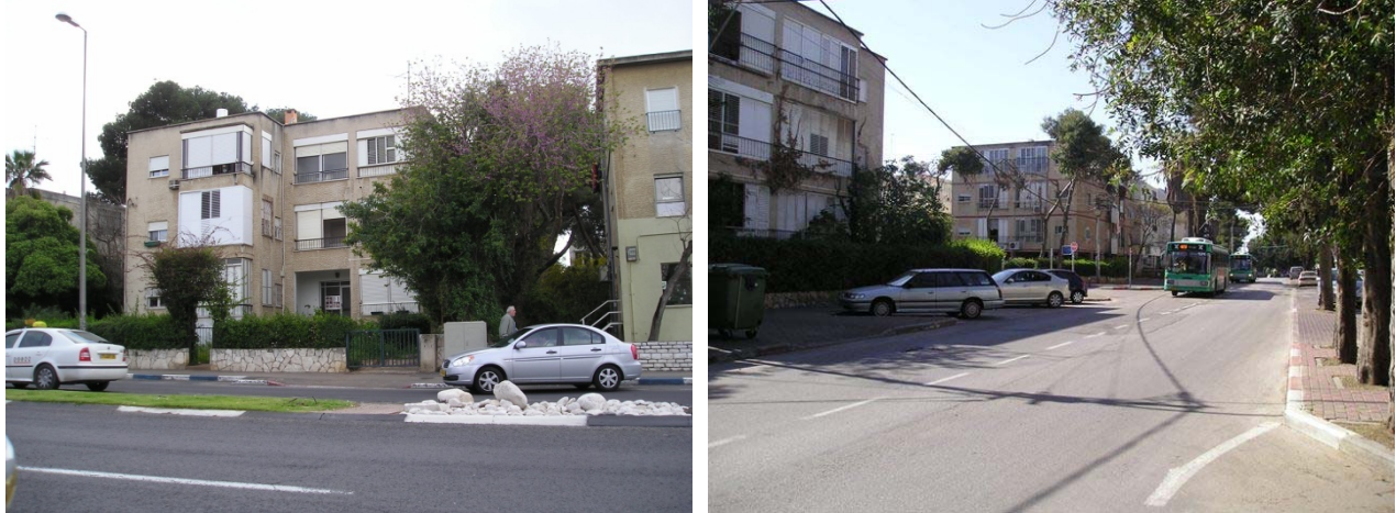
Figure 1 - Similar dominant housing type and style in Ahuza (left) and Neve-Shaanan (right)

In terms of socio-economic level, the CBS socio-economic index rating of the two neighbourhoods is similar: 7 in Neve-Shaanan and 8 in Ahuza on a 10-points national scale (CBS, 1995). In terms of shopping and leisure opportunities, although the Ahuza neighbourhood offers more shopping opportunities along its main street, both neighbourhoods are located within very short driving distance from nearby large and relatively new shopping malls, hosting a variety of shops, restaurants and coffee shops, cinemas and gyms. In terms of location and view, both neighbourhoods are located on the top of the Carmel Mountain and both neighbourhoods include properties without a view as well as properties looking at either the green Carmel mountain slopes or the Mediterranean sea of Haifa bay. The two neighbourhoods are also similar in terms of vegetation as demonstrated in Figure 2.