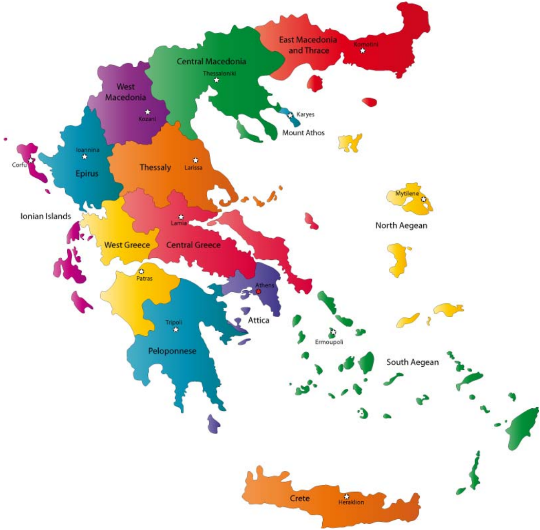
Figure 4.1. Regions of Greece

The methodology presented in the previous section is now used for the estimation of the Basic Image of the thirteen Greek regions (Figure 4.1). Furthermore, the relationship between Basic Image and GDP will be further examined.