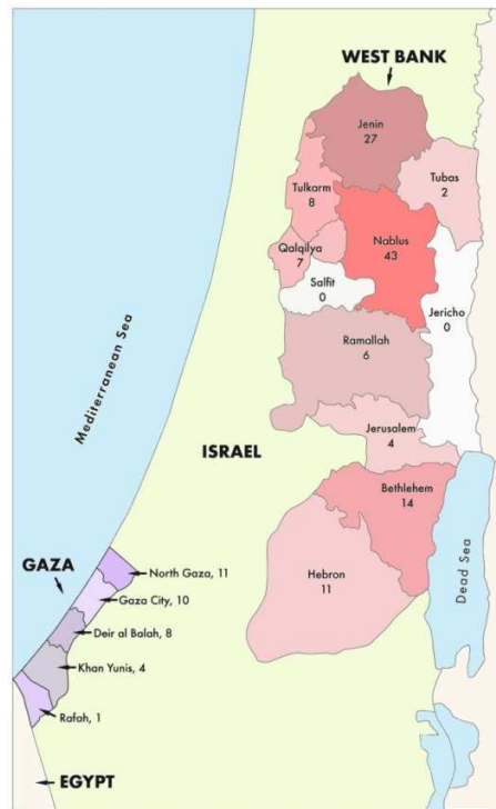
Figure 1. Number of suicide terrorists originating from different districts

Our analysis differentiates between suicide terrorists of high and low quality. We determine suicide terrorist quality on the basis of information on education, past involvement in terror activity, and age. Suicide terrorists of high quality are associated with more complex terror attacks, more important targets, and better outcomes for the terror organizations (Benmelech and Berrebi 2007).