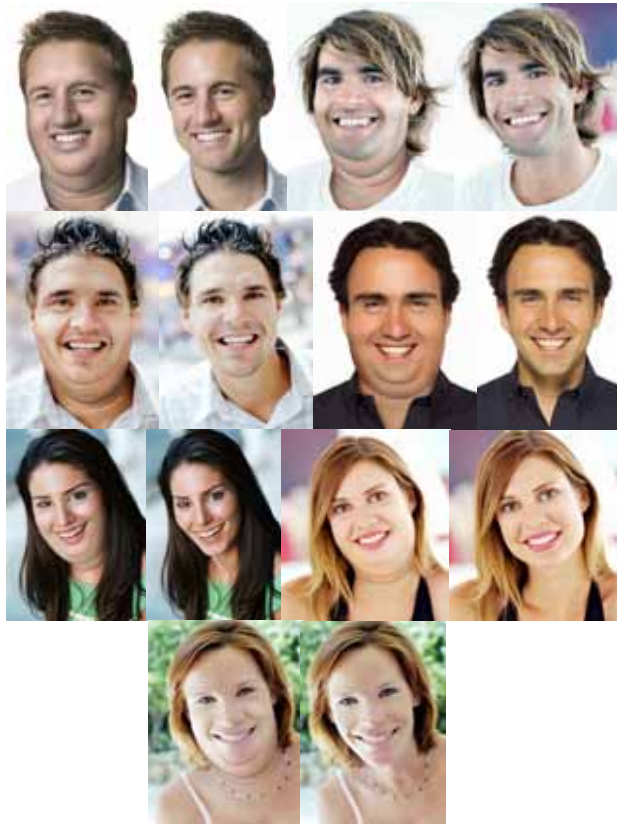
Figure 2. Photos of normal weight men and women manipulated to appear obese