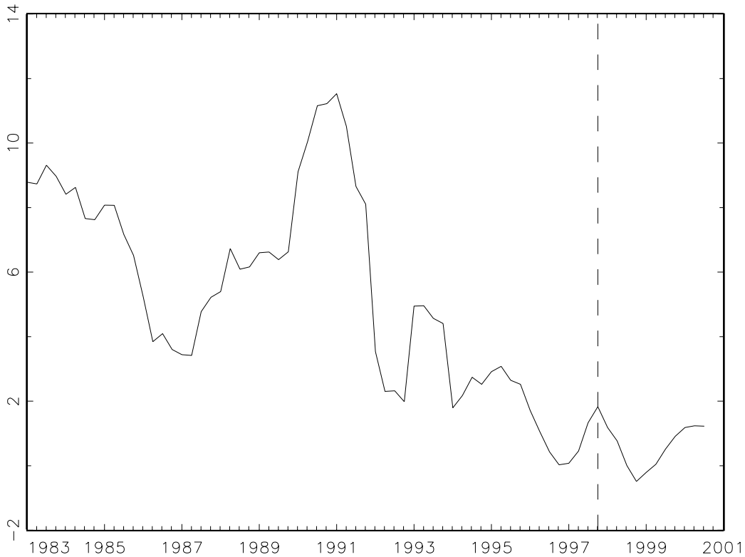
Figure 1 The Swedish inflation rate 1983Q1 - 2000Q3