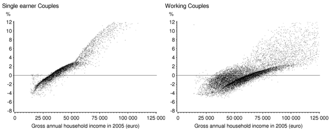
Figure 4.1 Income effects according to household type of a 37.5% flat tax in 2006 (% changes)

Figure 4.1 shows the income effects of the reform towards a 37.5% flat income tax rate for a large number of households, distinguished in six groups: one-earner couples, double earner couples, single workers, single benefit recipients, retired couples and retired singles. The figures show the results from simulations for 40.000 households, where each point in the scatter represents one household. We see from Figure 4.1 that the flat tax is especially harmful to people with low incomes, which is due to the rise of the tax rate in the first bracket from 34% to 37.5%. The reduction in income is around 4% for couples around 25 000 euro and for singles below this level of income. Singles and one-earner couples with a median income of around 29 500 euro also lose, but to a lesser degree than the lowest incomes. For incomes of around 31 000 euro, the reduction in the marginal rate in the second tax bracket more or less outweighs the higher rate of the first bracket, i.e. this is the break even point. Elderly people and those who depend on government assistance generally lose as they typically collect lower incomes than employees. People with high incomes gain, as much as 10 to 12% for the highest groups among working singles and couples. Overall, the flat tax reform is found to redistribute income from low to high incomes. The aggregate Theil measure rises by 6.5 percent.